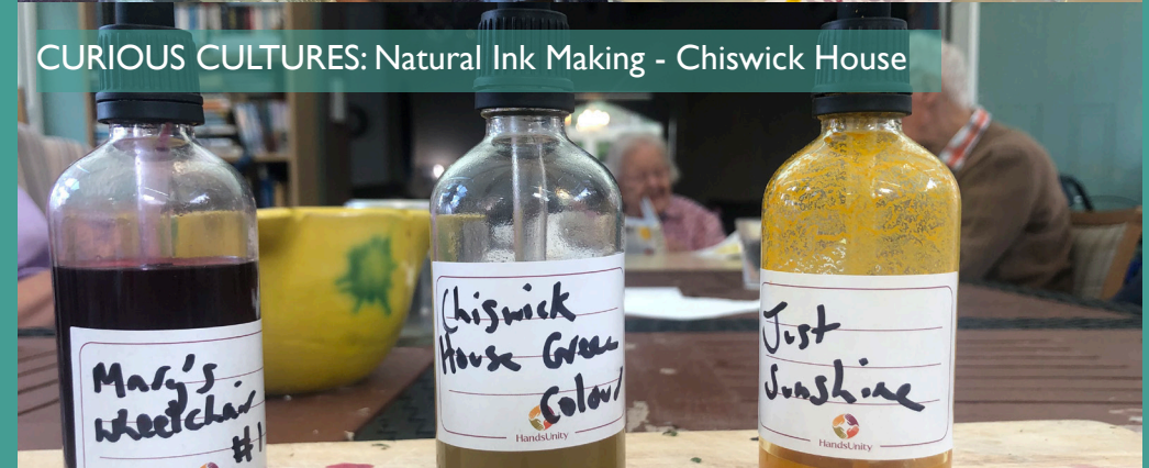
CURIOUS CULTURES: Natural Ink Making - Chiswick House