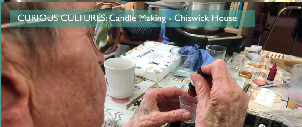
CURIOUS CULTURES: Candle Making - Chiswick House