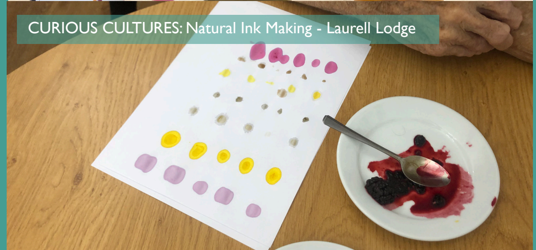
CURIOUS CULTURES: Natural Ink Making - Laurell Lodge