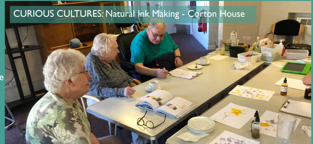
CURIOUS CULTURES: Natural Ink Making - Corton House