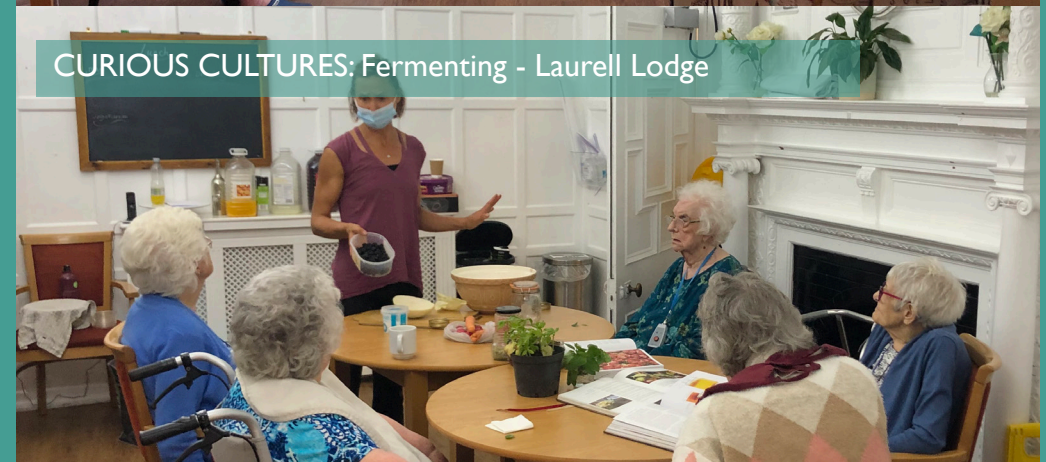
CURIOUS CULTURES: Fermenting - Laurell Lodge