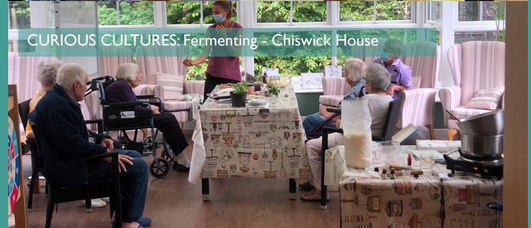
CURIOUS CULTURES: Fermenting - Chiswick House